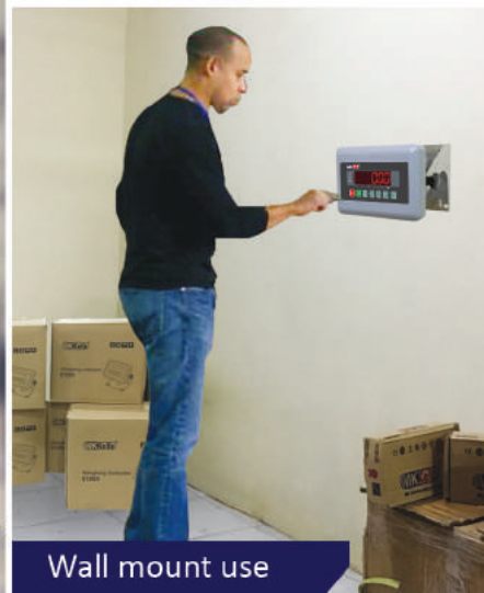
Wall mount use